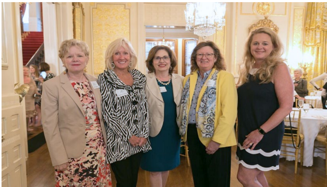
JLR Sustainers enjoying lunch at the N.C. Executive Mansion.