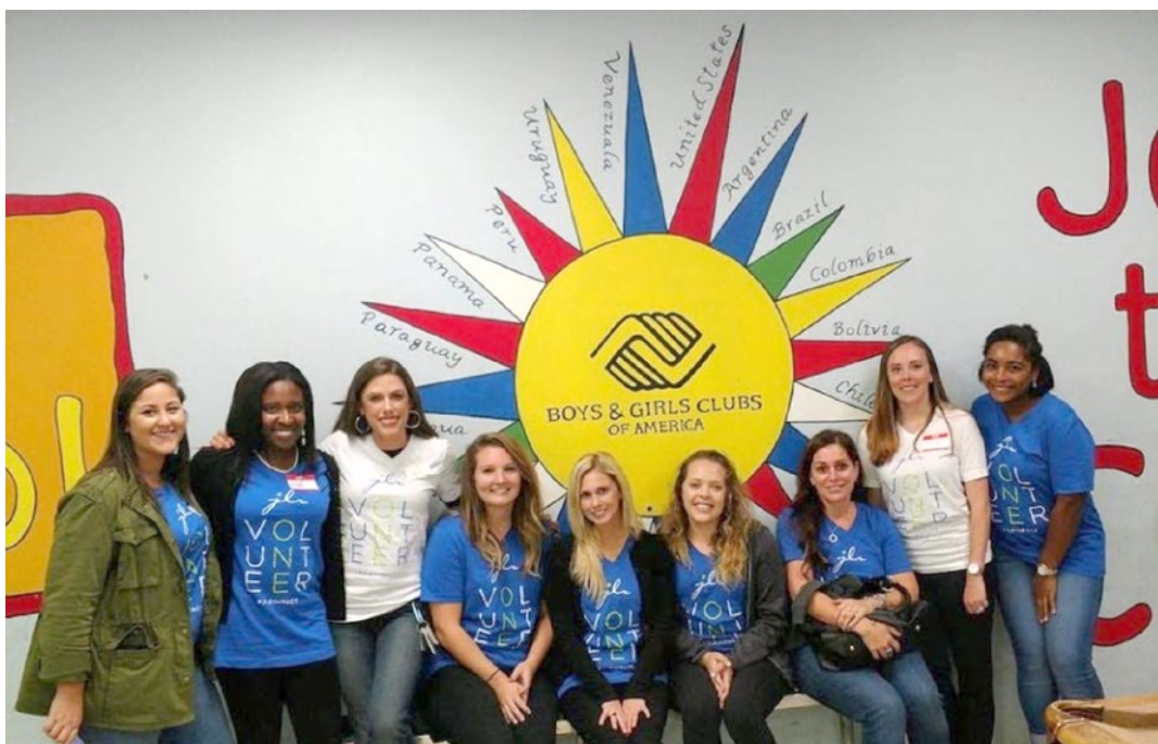
JLR volunteers give back thousands of hours of time to our community annually, including at the Brentwood Boys & Girls Club.