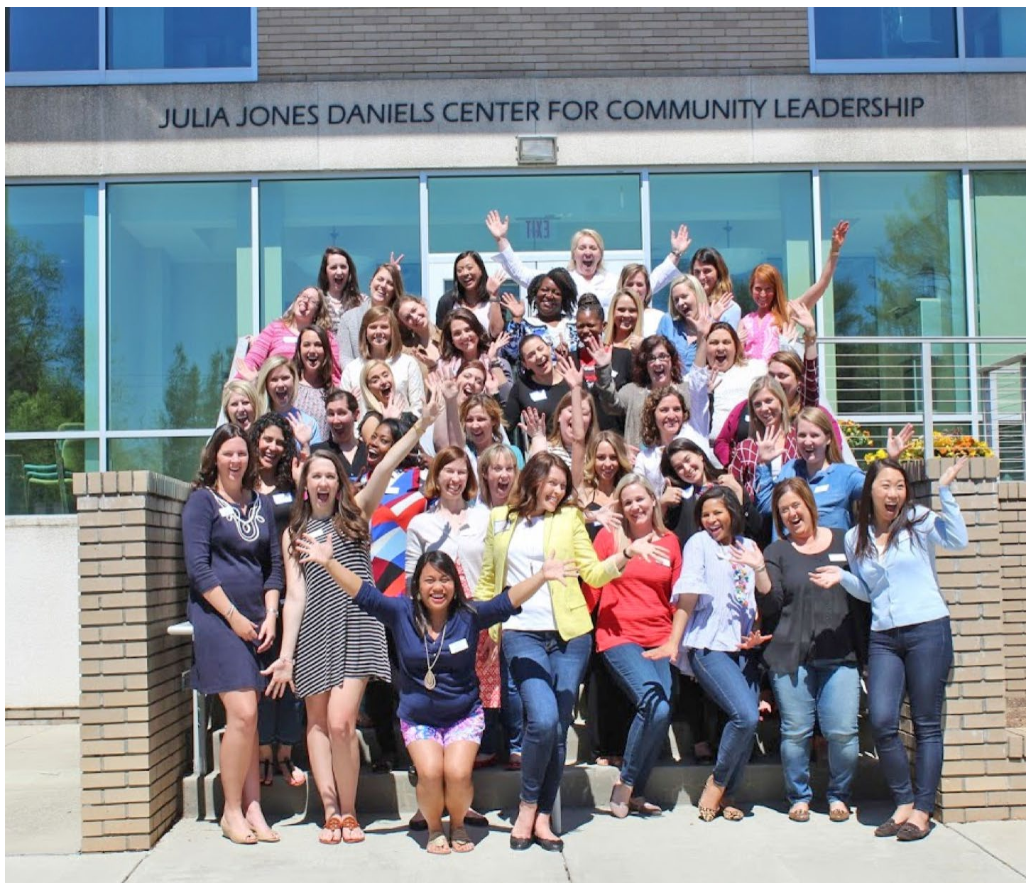
Members of the 2017-2018 JLR Leadership Team, including members of the Board of Directors, Management Council and Leadership Council.