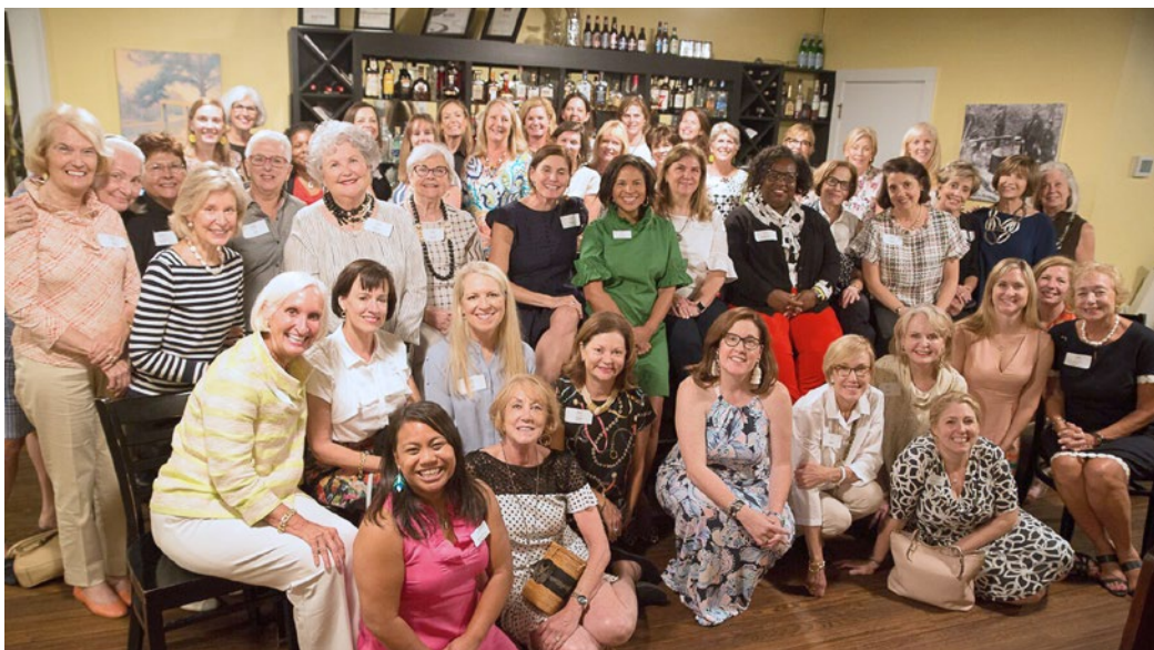
Members of the 2018-2019 1930 Society , donors who are recognized for their generosity to the Annual Fund, gather in Historic Tarboro to celebrate the success of the Annual Fund and the League's year of impact.