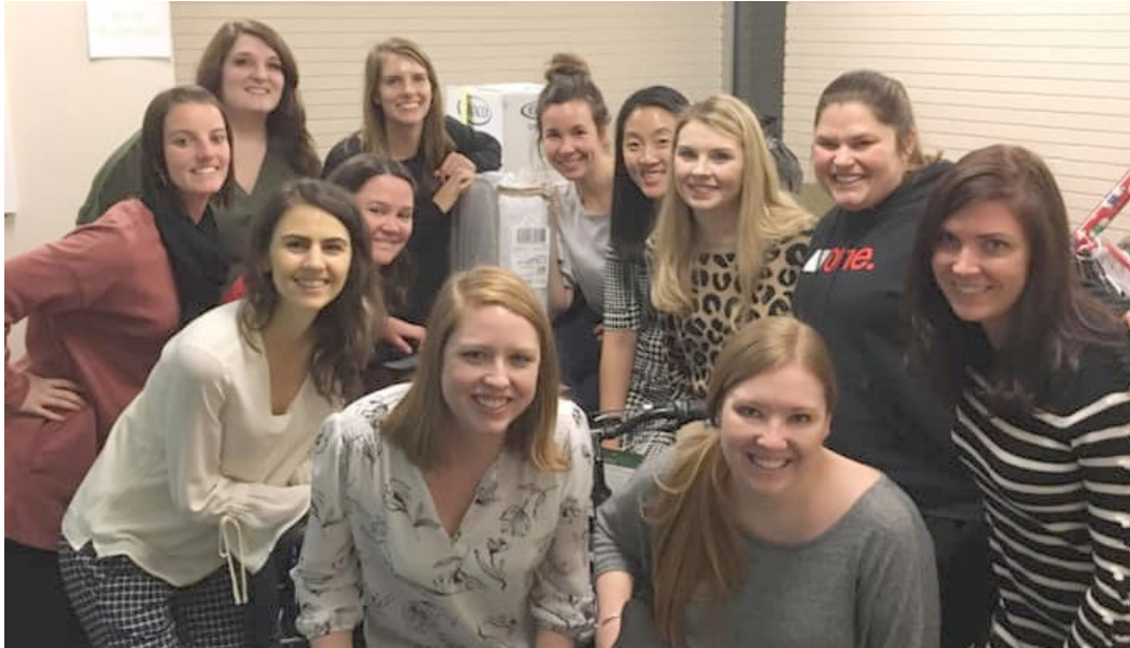
Bringing holiday cheer to parents during what can be a stressful time of year, members from Team Transfer collaborated on Angel Tree gifts for SAFEchild families.