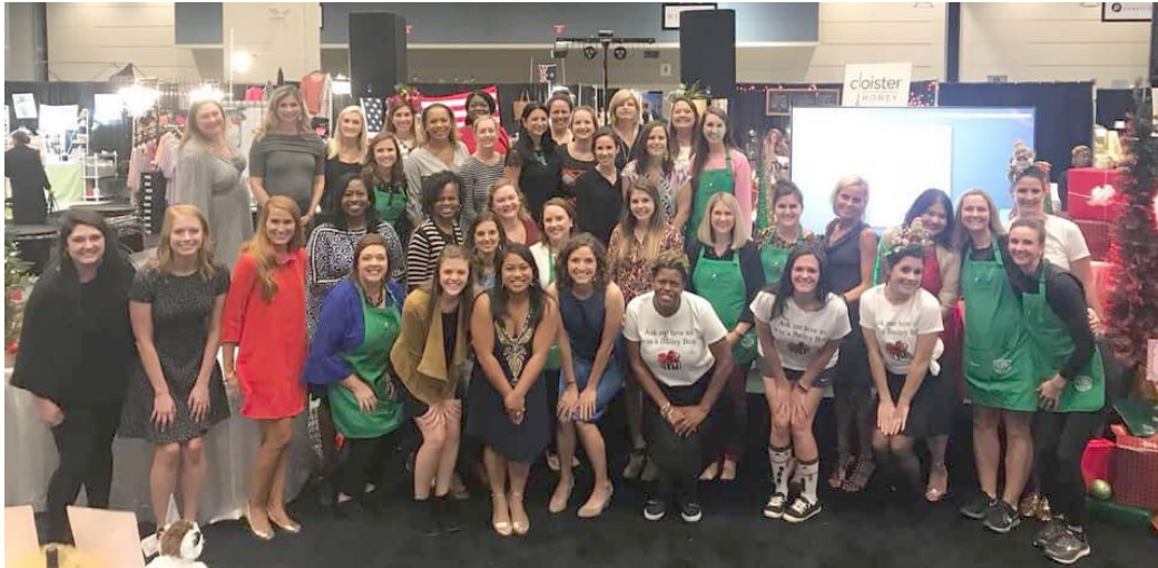
Shop 'til you drop! A Shopping SPREE! executive committee members celebrate during JLR's largest annual fundraiser.

Funds raised through JLR's annual campaigns support community projects, grants distributed to our area's nonprofits, training opportunities for our members and JLR operations.