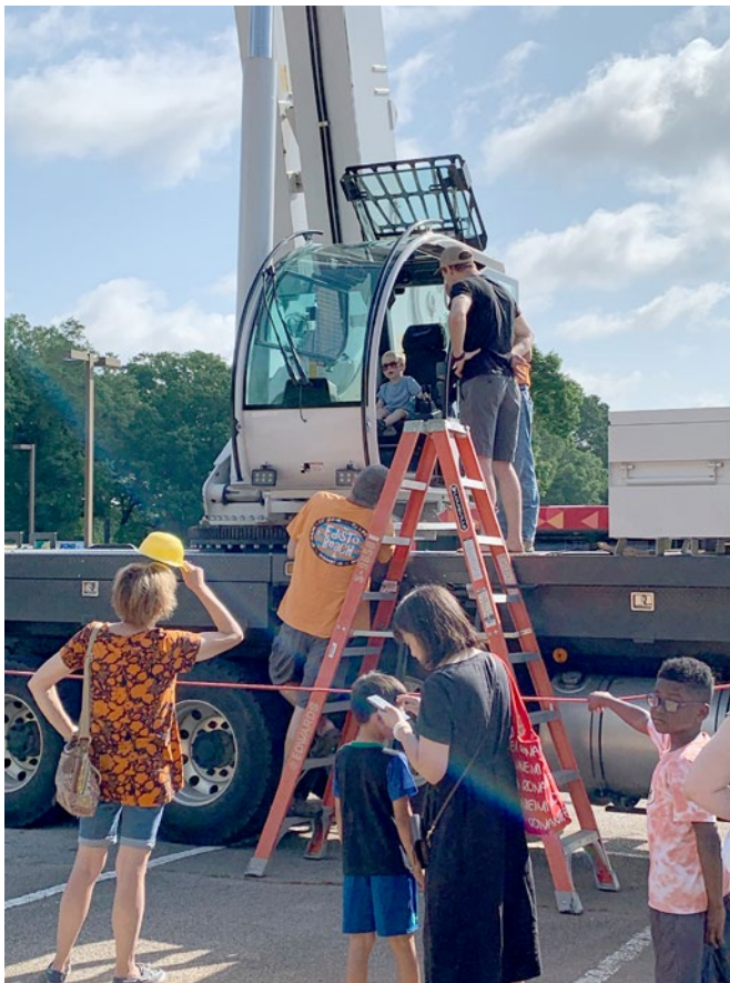
Vroom vroom! Touch-A-Truck dazzled kids of all ages and interests — featuring emergency trucks, construction equipment, big rigs and mobile machinery — with proceeds supporting our Backpack Buddies program.