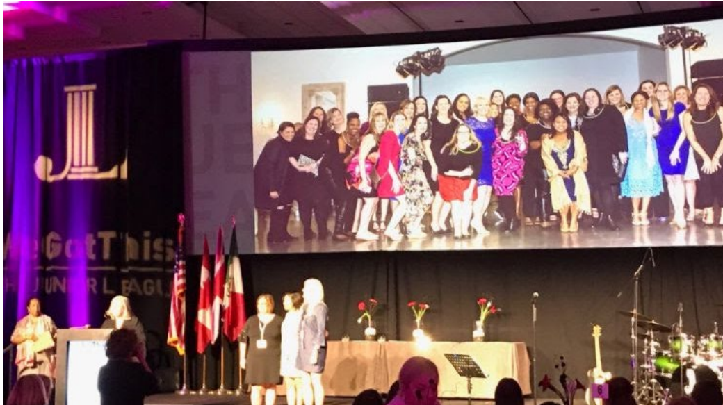
Leaders accept a national funding development award at the Association of Junior Leagues International annual conference.