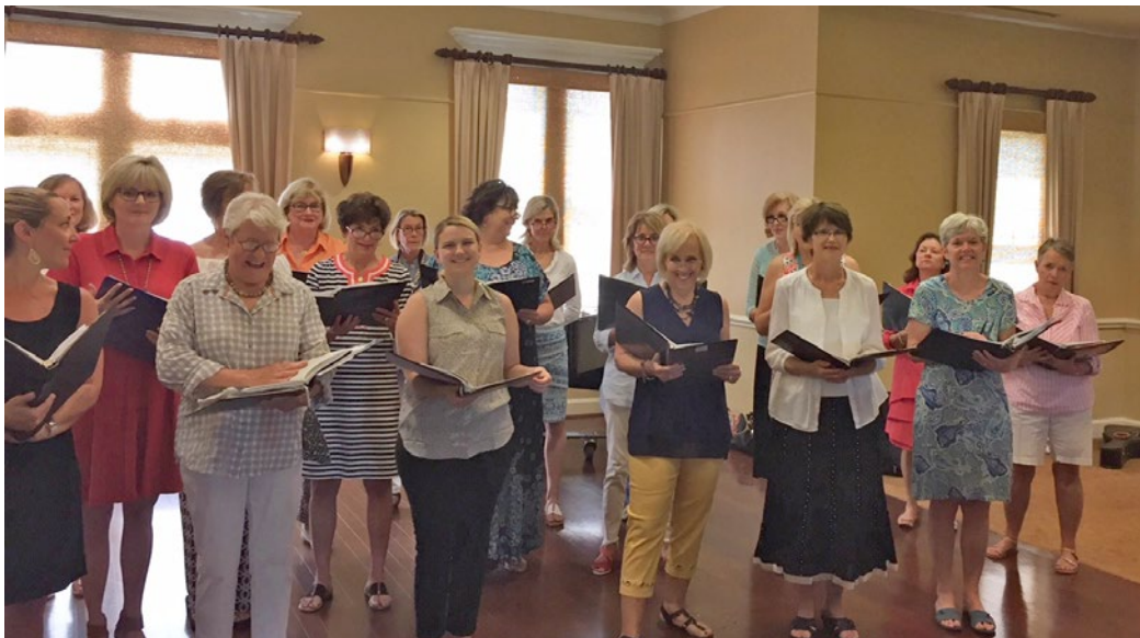
Fa la la! JLR Chorus members prepare music to perform for residents of nursing homes and retirement centers.