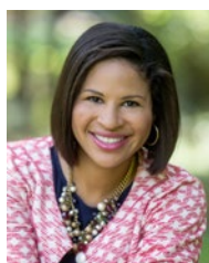
Astra Ball President-elect