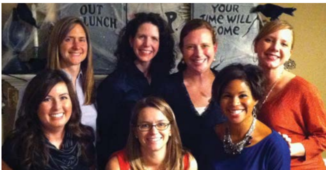
The Nominating team