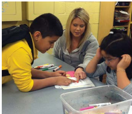
Boys & Girls Club volunteer in action