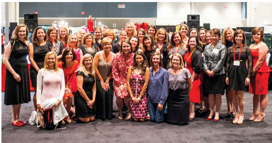
The A Shopping SPREE! team before the Preview Gala.