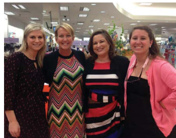
Belk Fashion Forward team