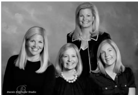
Inaugural Ball Co-captains