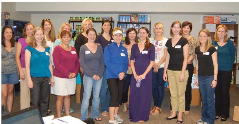
BackPack Buddies Team