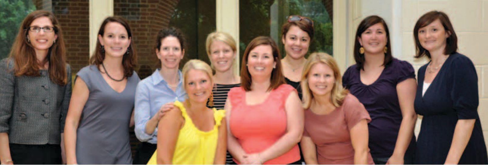
Members of the StepUP team.