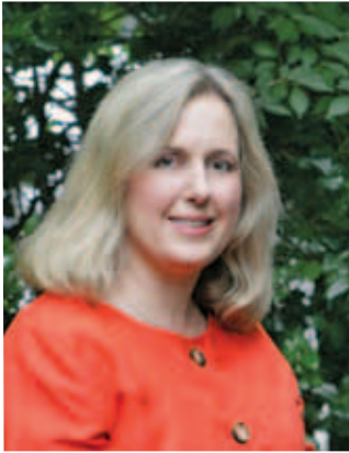
BURNIE BACHELOR STUDIO, INC.