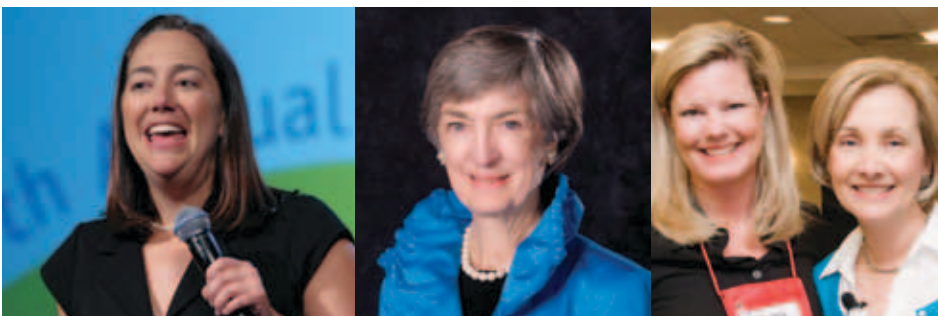
Erin Gruwell, conference keynote speaker and founder of the Freedom Writers Foundation.

At the conclusion of the conference, we adopted a new vision statement, "The Junior League: Women around the world as catalysts for lasting community change." More than 650 delegates from Junior Leagues around the world left Atlanta with the vision to create lasting community change!